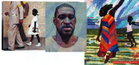
Pictures of Ruby Bridges walking to school in USA 1960, George Floyd and cover of the book Teaching for Black Lives.

The horrific death of George Floyd in Minneapolis, USA which sparked mass activism across the world, including the UK, in support of anti-racism has brought media attention to the long fought and continuing campaign to challenge racism, injustice and oppression. CASP as a black-led organisation supports the peaceful campaign against racial injustice. PLEASE TURN OVER PAGE